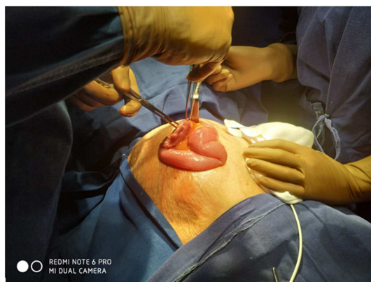
Figure 2. Bowel exteriorization in case two.

A 20G intra venous line was secured, standard monitors were attached. In supine position under strict asepsis, a real time ultrasound guided (HFL38x/13-6 MHz Linear Array Transducer; Sonosite M-Turbo™, Bothell, WA, USA) bilateral rectus sheath block was performed using a 22G (0.70 mm × 50 mm) Stimuplex® A insulated needle (B. Braun, Melsungen, Germany) via an in-plane approach. The site of needle insertion was just above the level of proposed incision. 5ml of 2% xylocard (100mgs) with 10ml of 0.75% ropivacaine (75mgs) was deposited on each side between rectus abdominis muscle and posterior rectus sheath [Figure 1].