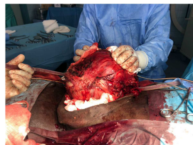
Figure 3. The royal tumor, after incision.

Before closing the dorsal incision, the patient received an intrathecal injection of 200 gamma morphine.