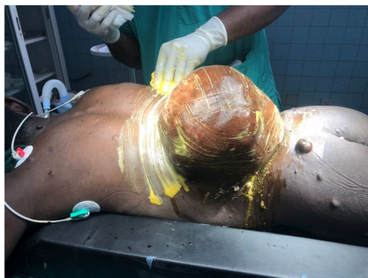
Figure 1. The royal tumor on patient intubated in prone position.

The patient was installed in ventral decubitus with blocks under the thorax at shoulder height and at the level of the pelvis with verification of the freedom of the neck and abdomen.